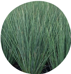
Juncus Rush, Blue Dart