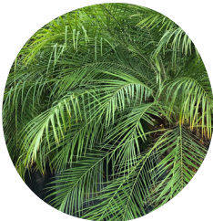
Palm Roebelenii, Phoenix