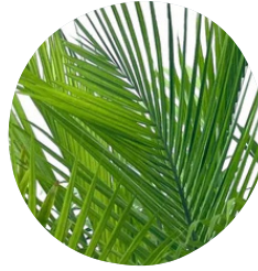
Palm Ravenea, Majesty