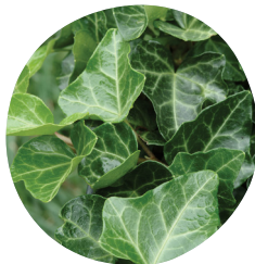
Ivy, Green Algerian