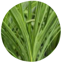
Cordyline Spike, Green