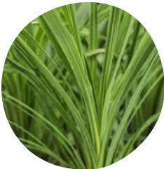
Cordyline Spike, Green