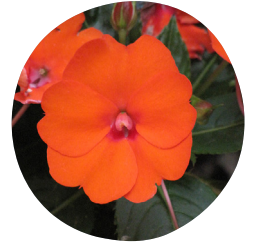
Sunpatiens, Electric Orange