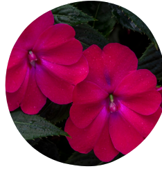
Sunpatiens, Rose Glow