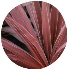
Cordyline Spike, Red