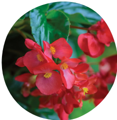
Dragon Wing Begonia, Red