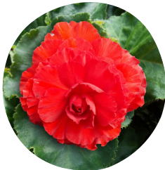
Tuberous Begonia, Red